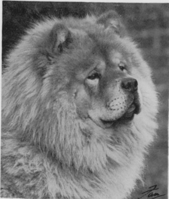
GREAT WESTWOOD HERCULES appreciated by experts of the breed.

Great Westwood Valentine, born 11th February 1941, a home-bred smooth, won outright the Blake cup for the best home-bred puppy. Valentine is by Great Westwood Cupid, out of Suzette of the Follies, and has done exceptionally well in puppy classes.