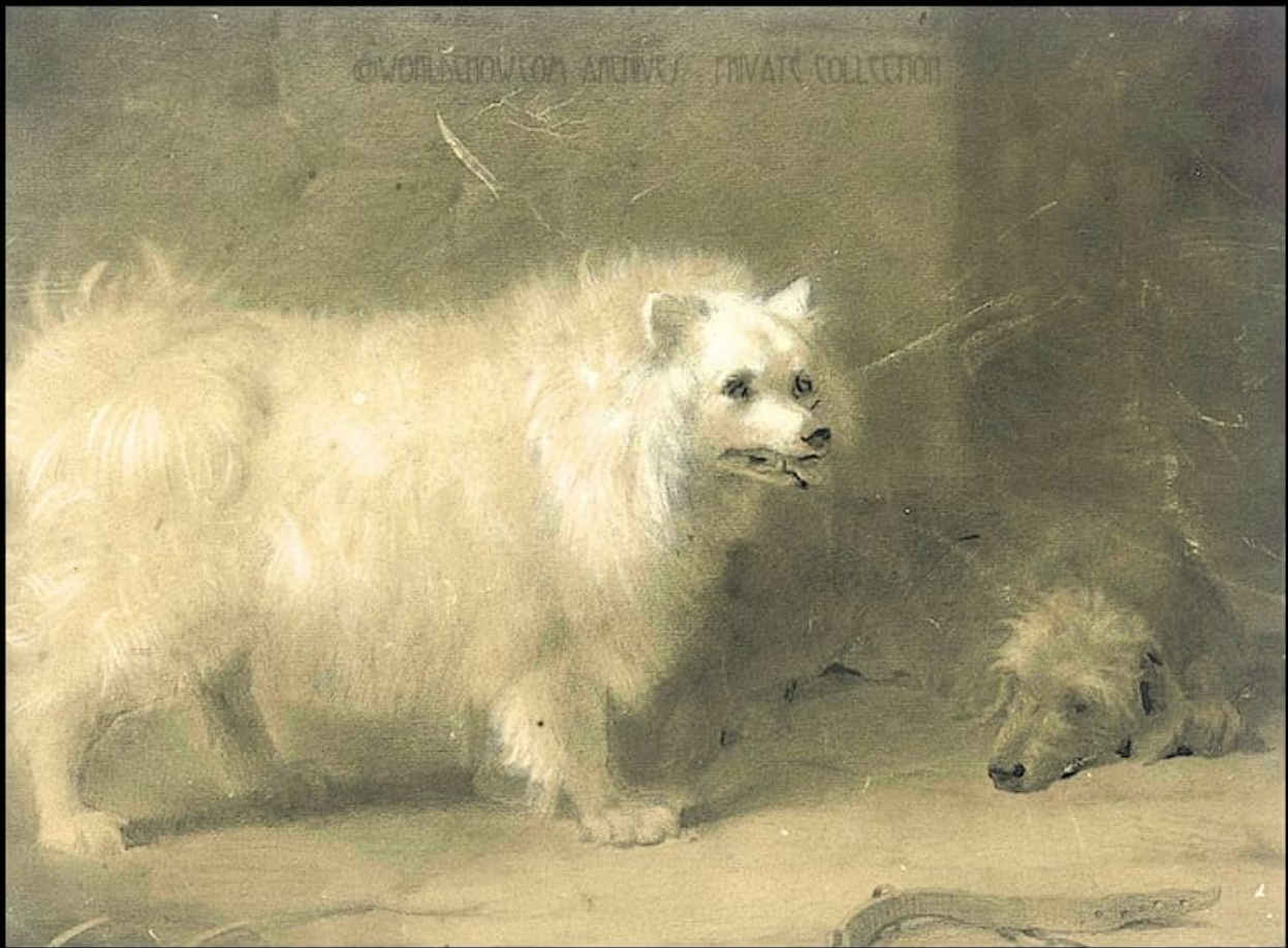
ARTIST ARCHIBALD THORBURN - CHOW 1884

The coat color "white" was mentioned quite often in articles and books of the late 1800's until about 1915 or so. I want to add more to this page as I find new images and mentions of the white chow which differs from the cream who has "biscuit" ears. These two examples are good ones. The painting above was titled by the artist "Chow", and the dog exhibits a blue tongue, so we know this is indeed a "chow" and not a Samoyed or Spitz represented