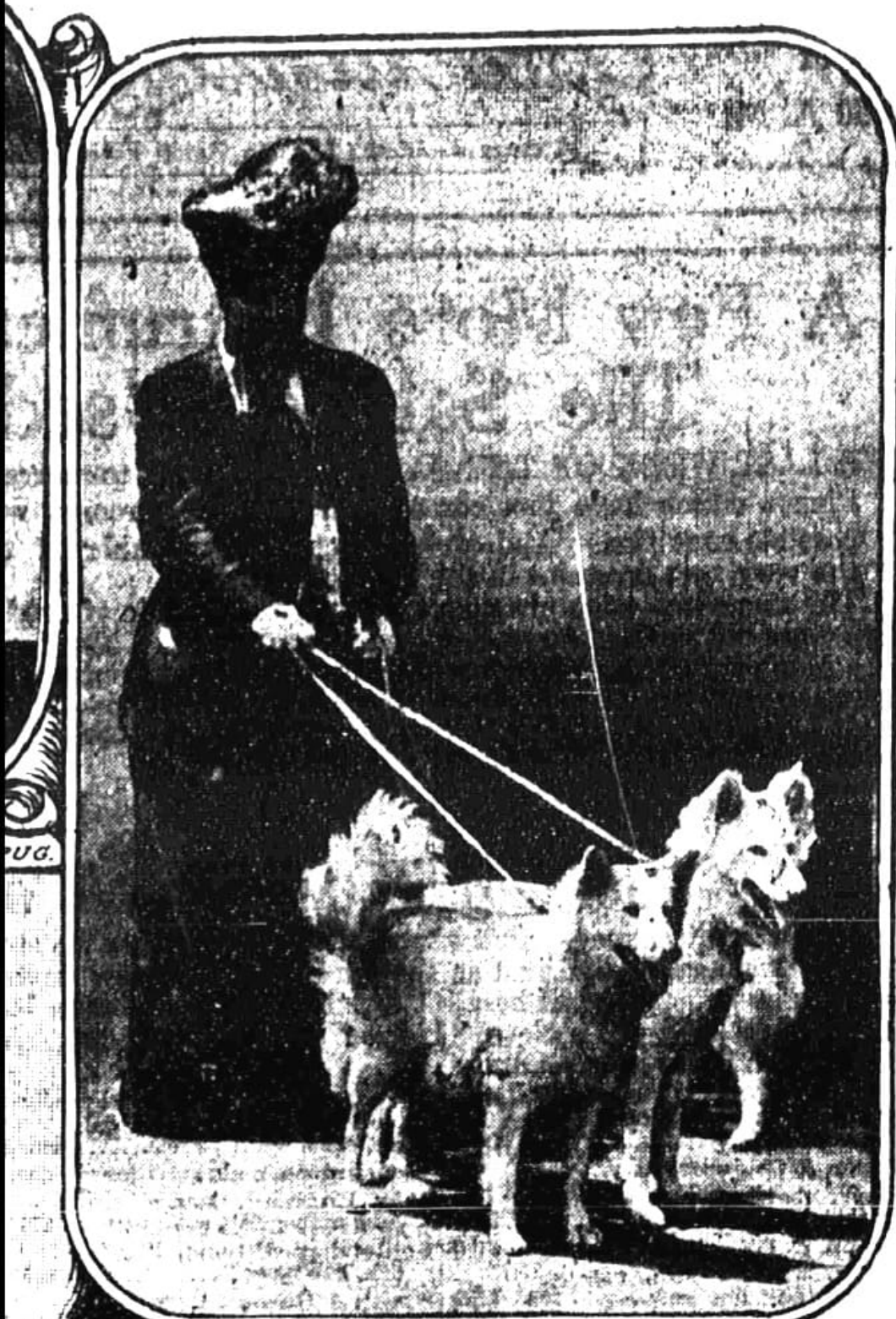
PRINCESS DE MONTAGLYN AND HER WHITE CHOWS.