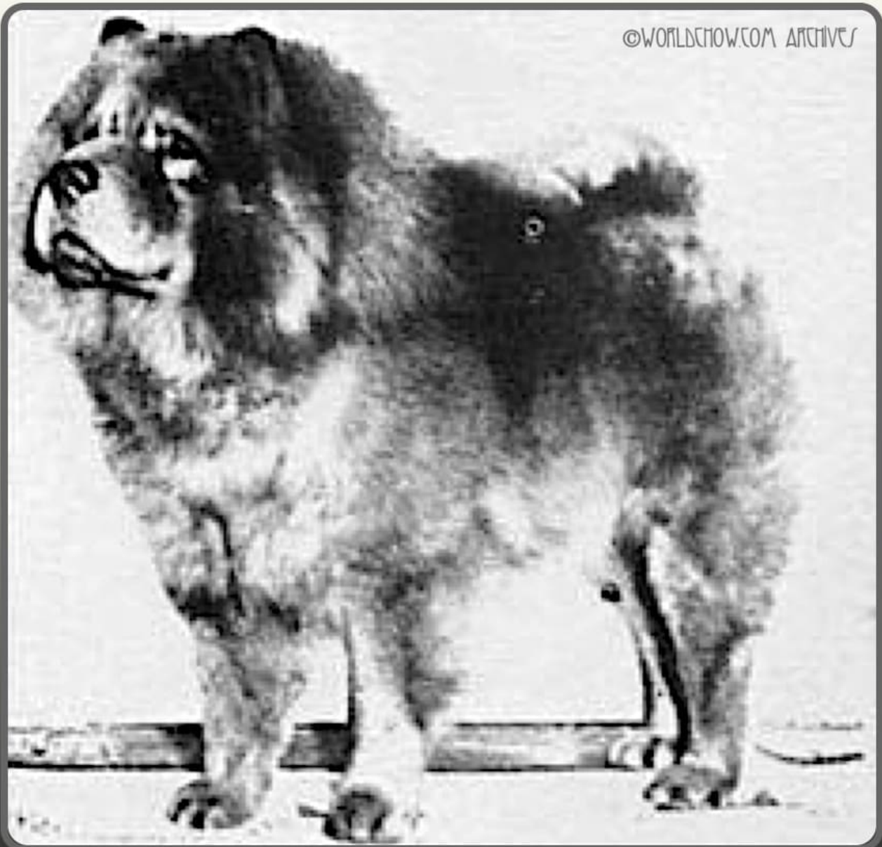
CH. YANG FU TANG 1932 CHOW NATIONAL BEST OF BREED

known as this record holding dog was, his photographs are elusive. The cover art was most likely based on the photo below...the only REAL photo I have in my collection of him to date.