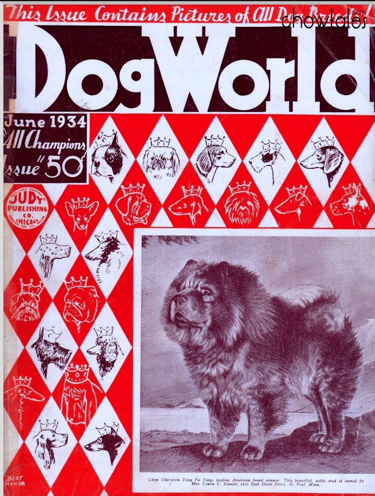
Vintage image from the

Above is an extremely rare Dog World cover from June 1934 in my personal collection highlighting Ch. Yang Fu Tang. As well