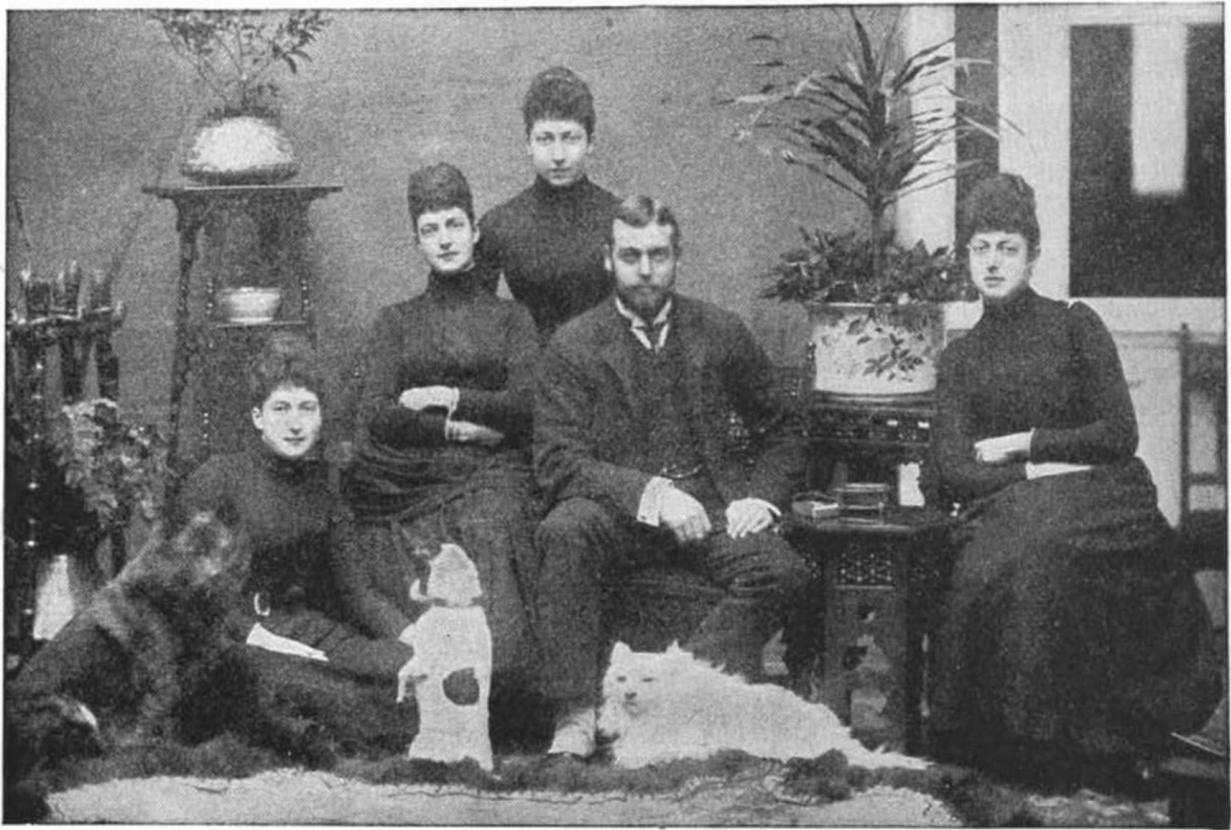
FAMILY GROUP, WITH PLUMPY, GUMMY AND HUFFY.