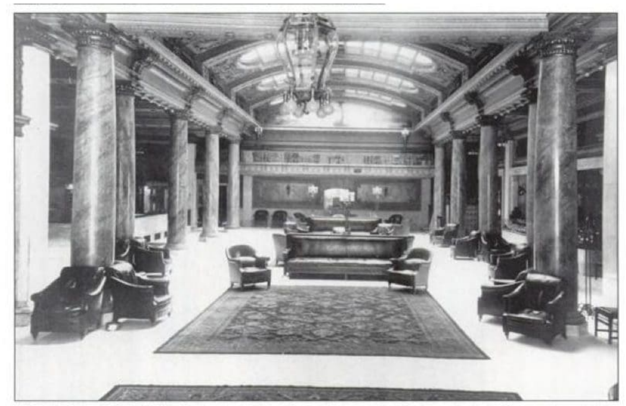
THE HOTEL SECOR LOBBY. An open interior court provided light and air to the spacious lobby and the inner rooms. It was the hotel's richest space with marble columns, oriental rugs and comfortable leather chairs. At the grand opening four orchestras played and "ladies in hats which towered with floral pieces and smoking cigarettes swept about, while the gentlemen were imposing in high collars and glittering watch fobs."