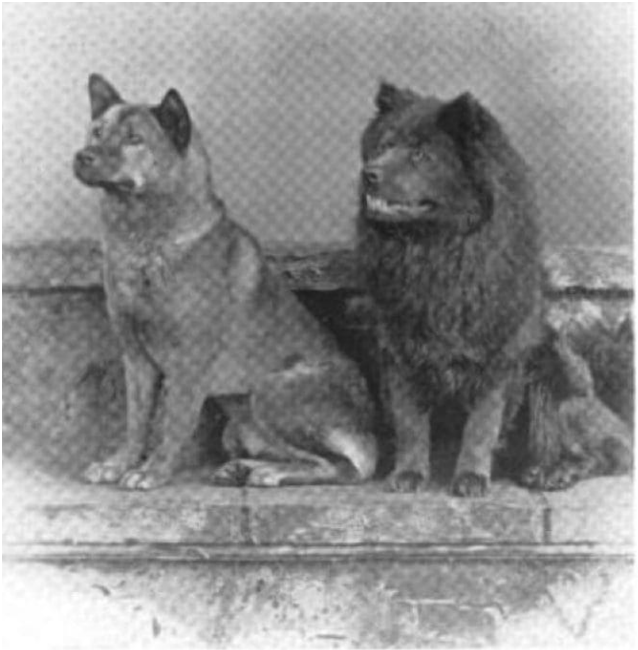
BLUE BLOOD AND MI HI, Hyde Park Corner.

BLUE BLOOD PICTURED WITH ONE OF THE EARLIEST SMOOTHS IN ENGLAND, MI HI