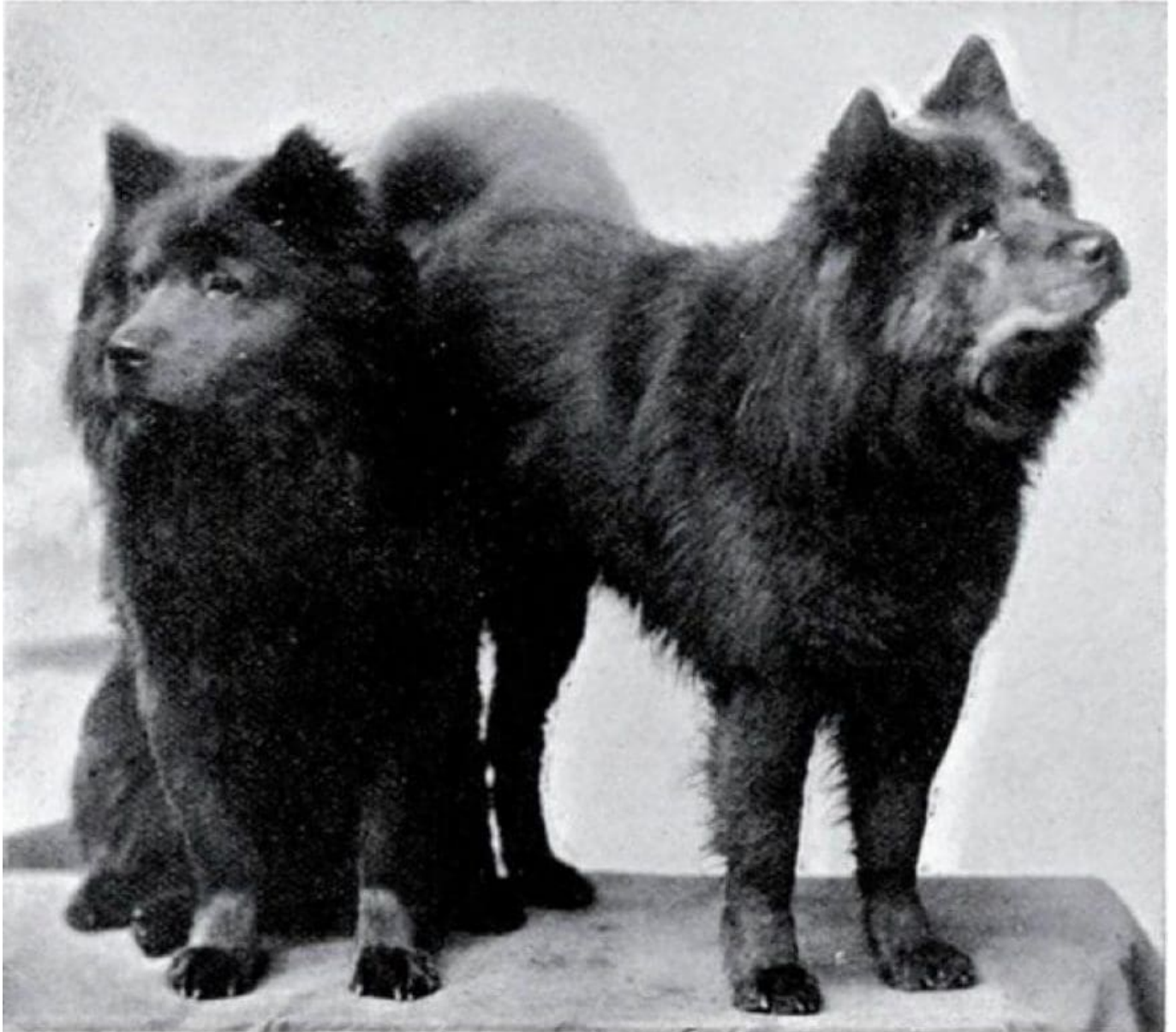
CH BLUE BLOOD. PERIDOT II.

PICTURED ARE CH. BLUE BLOOD (left) WITH HIS SIRE PERIDOT II (right).