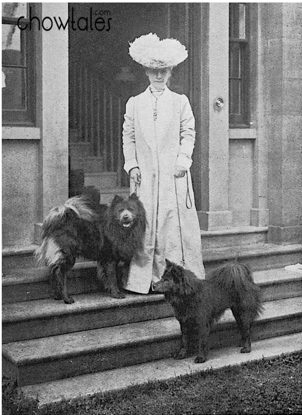
“ BLUE JOSS ” AND “ BLUE CHINA ”

PHOTO PLATES FROM 'THE CHOW CHOW' by Lady Dunbar of Mochrum Third Edition 1924