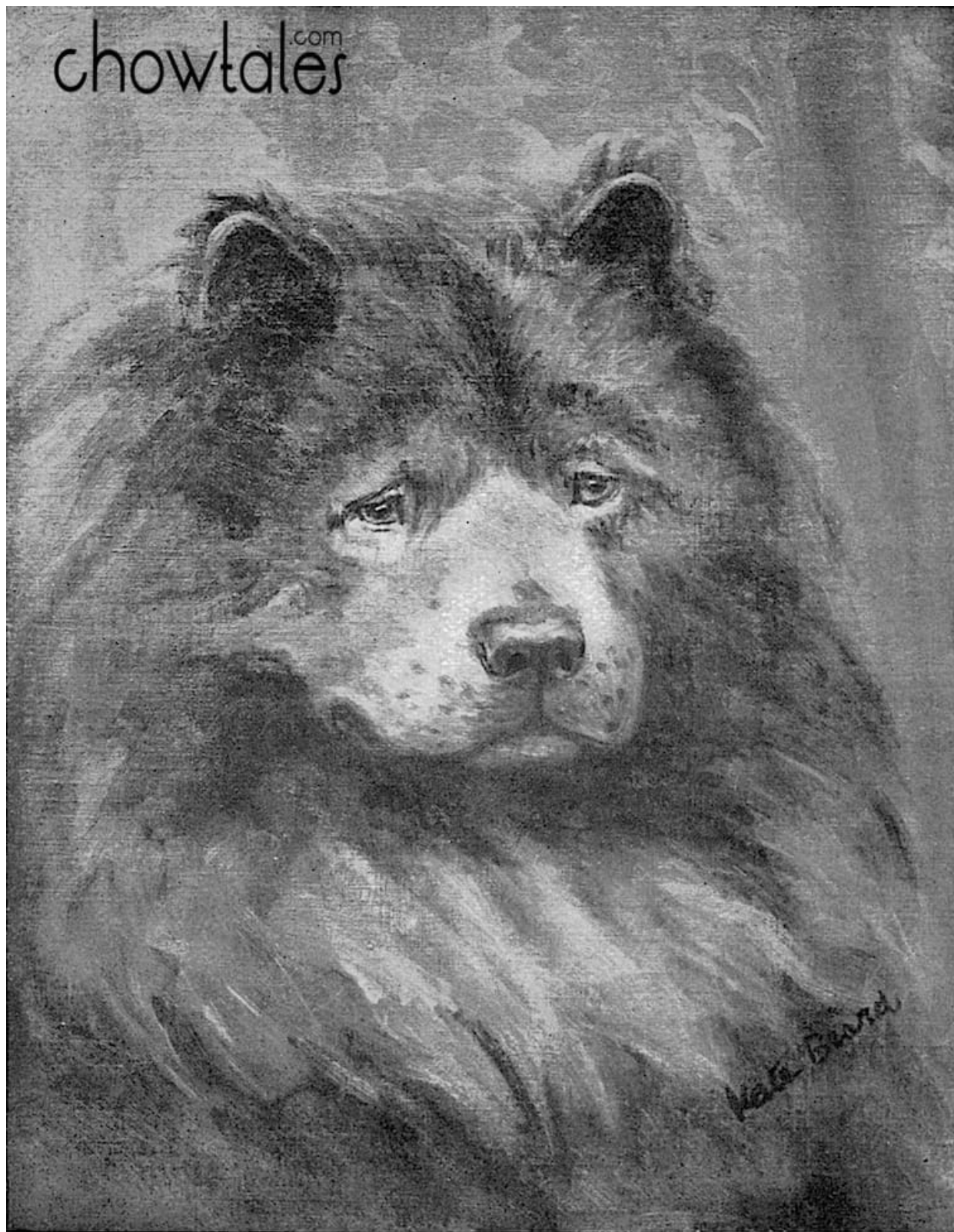
“ BLUE JOSS ” (from a painting by Kate Beard)

PHOTO PLATES FROM 'THE CHOW CHOW' by Lady Dunbar of Mochrum Third Edition 1924